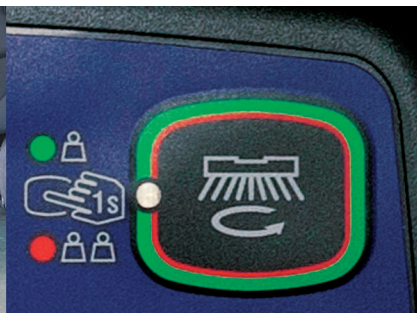
Raise, lower or even double the brush pressure right from the dashboard for even more cleaning power.