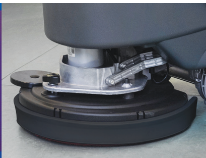
Optional splash guard keeps water in the path of the squeegee even at the fastest operation speeds.