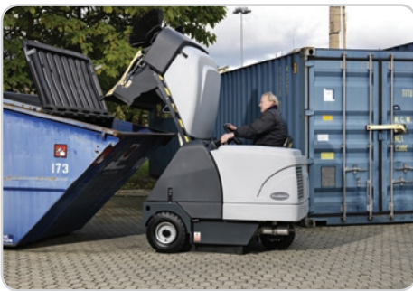
Variable dump height of up to 62 inches allows fast and simple disposal of swept debris