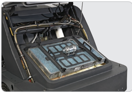
Patent pending Liberator™ Variable Frequency Filter Shaker System removes dust more effectively from the panel filter, resulting in better air flow and dust control.