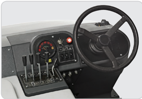
Ergonomic operator interface uses Analog-logic™ which allows a single operator motion to lower and activate the main broom and side brooms and open the hopper door.