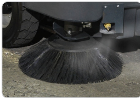
DustGuard™ suppresses airborne fugitive dust where most dust is generated – at the side brooms