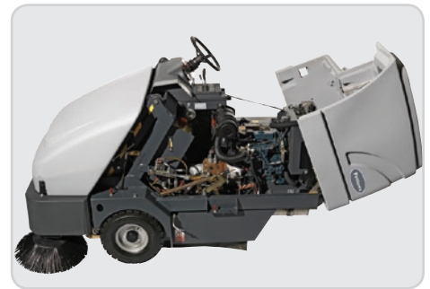
MaxAccess™ allows faster repairs and less downtime so the sweeper spends less time in the shop and more time sweeping