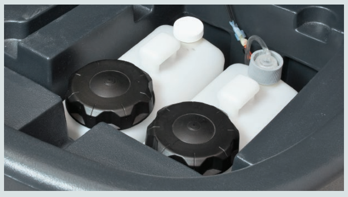
EcoFlex<sup>™</sup> System with interchangeable dual detergent cartridges are refillable with your favorite brand of detergents.