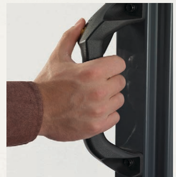
Rear Assist Grip w/Horn