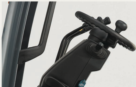
Smaller Steering Wheel

Toyota's sit-down counterbalance design prioritizes comfort and versatility. Controls are designed and positioned for easy access and intuitive functionality, enabling confident control of the forklift in forward or reverse. Add the ergonomic benefits of the smaller steering wheel, foot parking brake, weight-adjustable full-suspension seat and dual-side entry with assist grips. The result? Increased comfort and a more productive experience.