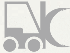
PAPER ROLL SPECIAL